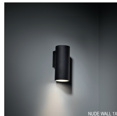
NUDE WALL 1X