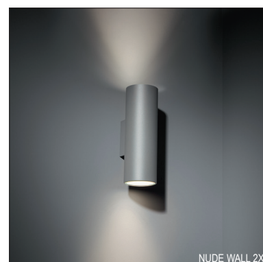
NUDE WALL 2X